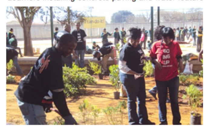
Huluwazi Secondary school project - Mandela Day