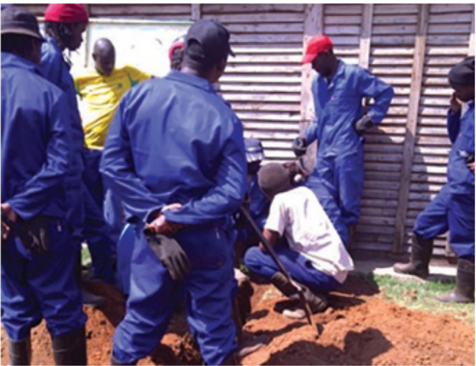
Learners installing irrigation equipment